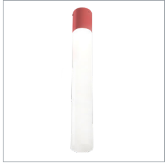
OPALINE TUBE WITH COLOUR MASK